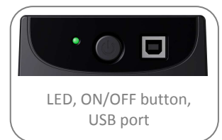
LED, ON/OFF button, USB port