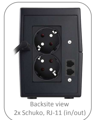
Backsite view 2x Schuko, RJ-11 (in/out)