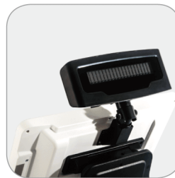
Customer Display Easy Installation