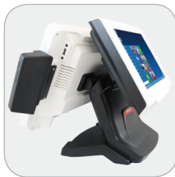
2nd LCD Display