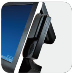
MSR & Finger Printer