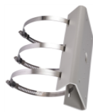
DS-1275ZJ Vertical pole mount