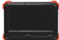
DS-TT-X41T TVI Tester