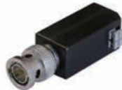
DS-1H33 Video Balun