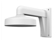
DS-1273ZJ-130-TRL Wall Mounting