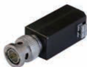
DS-1H33 Video Balun