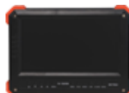
DS-TT-X41T TVI Tester