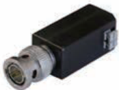
DS-1H33 Video Balun