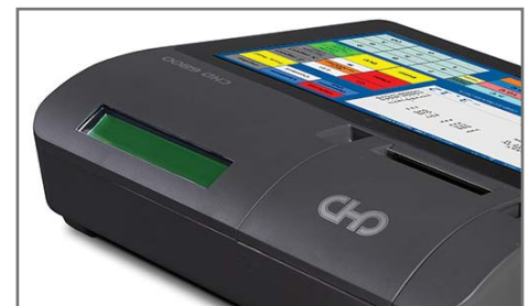
CUSTOMER DISPLAY, 240 x 48 dot

Microsoft, Windows, Intel and Realtek are the trade marks of their respective owners.