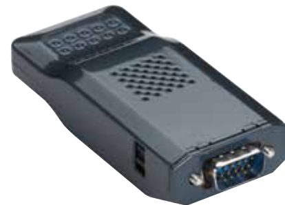
Micro Wireless VGA Presentation Tool (AVX-VGA-WI)