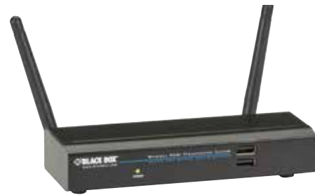
Wireless HDMI Presentation System (AVX-HDMI-WI)