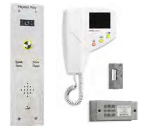
Model DDABS1/VR 1 way video system

Order using model DDA-BSn/VR where n is the number of stations. e.g. DDA-BS1/VR is a complete 1 station video system and DDA-BS4/VR is a 4 station system (for tradesmen facility, add the code TRDDA)