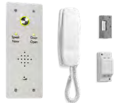
Model DDA1/VR 1 way audio system

Order using model DDA-n/VR where n is the number of stations for systems with a flush panel or model DDA-n/VRS for systems with a surface panel. e.g. DDA-1/VR is a complete 1 station flush system and DDA-4/VRS is a 4 station surface system (for tradesmen facility, add the code TRDDA)