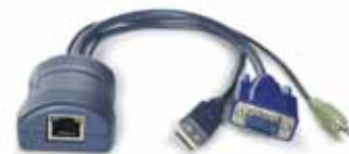
Example CAM: CATX-USB-A

Sun CAM: CATX-SUNA (Sun plus audio) Serial flash upgrade cable (4-way jack connector to 9-way D-type male serial connector): CAB-9DF-RJ9-2M